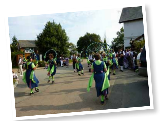
Wight Bells - Sandown Pier 2:00pm - 3:00pm