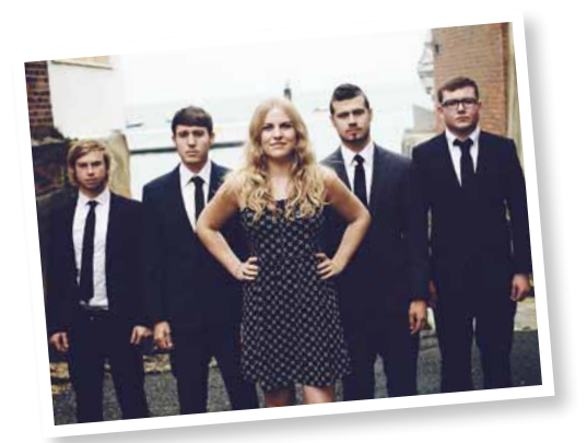
Groove Union - Eastern Gardens 11:00am - 2:00pm