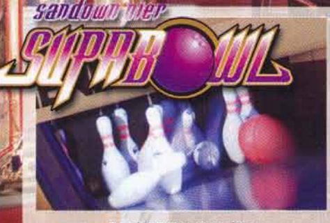
Real 10 Pin Bowling located by the Ancient Aztec Temple ... great for all ages!