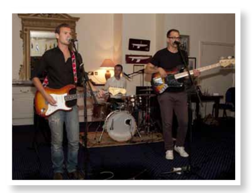
Switch - Eastern Gardens 4:30pm - 7:30pm

FREE to enter - and all entrants receive a small prize!